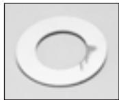
Flat Faced Ring